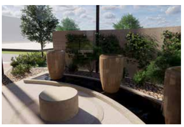
The outdoor meditation and reflection garden is adjacent to the sanctuary.

solitude to go to. I think that is so important," said Bishop.