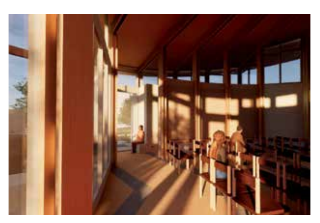
The sanctuary is a place that accommodates all means of student spiritual needs including reflection, meditation, relaxation, prayer and other ways that students focus on what gives their lives meaning.